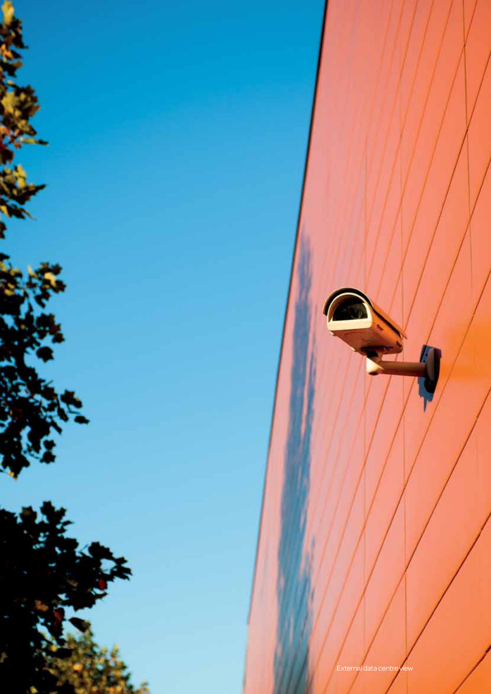
External data centre view